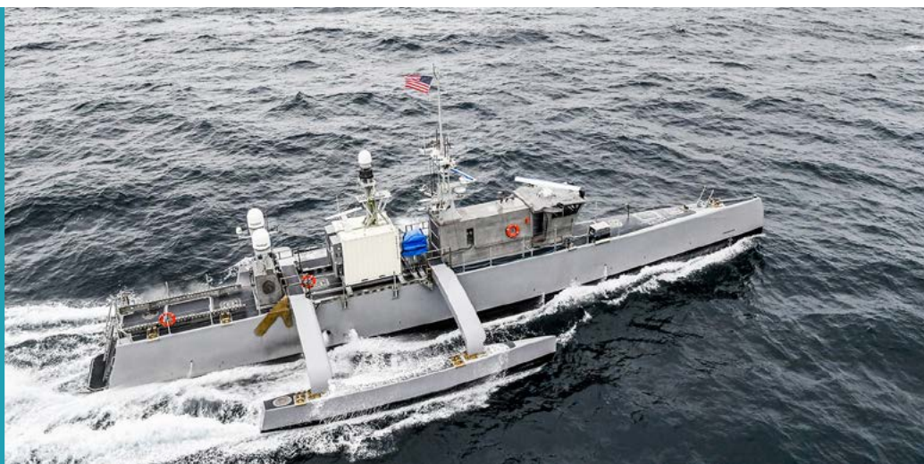
A Seahawk medium displacement unmanned surface vessel participates in U.S. Pacific Fleet's Unmanned Systems Integrated Battle Problem (UxS IBP) 21 on April 21, 2021.

By Philip DeCocco, EAG Intern, Summer '21