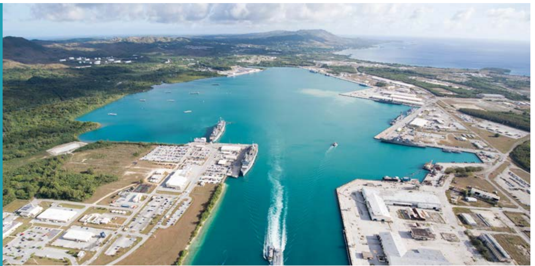
An aerial view of U.S. Naval Base Guam shows several Navy vessels moored in Apra Harbor.