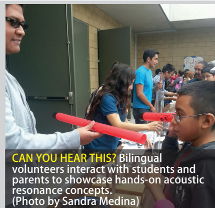
CAN YOU HEAR THIS? Bilingual volunteers interact with students and parents to showcase hands-on acoustic resonance concepts.

CREATE’s ability to leverage local student organizations through their academic network allows for increased participation and awareness. The lasting ties developed with San Diego’s college organizations, including the Society of Hispanic Professional Engineers and MAES (Mexican American Engineers and Scientists) Latinos in Science and Engineering, will continue to evolve and provide a volunteer pool for future events. As these events continue to grow, SSC Pacific employees will keep working with the local community to inspire future Hispanic STEM innovators.