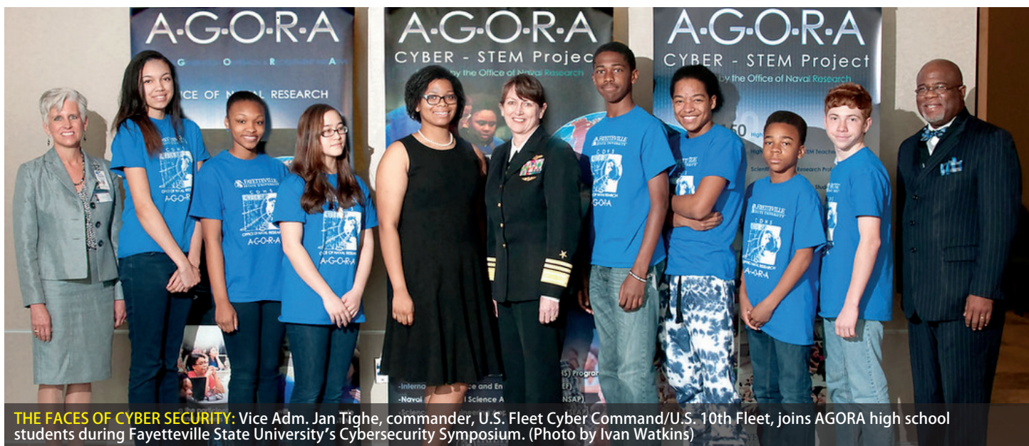
THE FACES OF CYBER SECURITY: Vice Adm. Jan Tighe, commander, U.S. Fleet Cyber Command/U.S. 10th Fleet, joins AGORA high school students during Fayetteville State University's Cybersecurity Symposium.