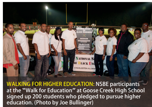
WALKING FOR HIGHER EDUCATION: NSBE participants at the "Walk for Education" at Goose Creek High School signed up 200 students who pledged to pursue higher education.

Stall High School. Through NSBE, volunteers stress the importance of STEM and higher education to students. At a "Walk for Education" event, held at a Goose Creek High School football game, volunteers and students from the NSBE Junior chapter walked the football field to promote STEM education. More than 200 students pledged to pursue higher education. Working with NSBE, HBCU, SWE and Women in Defense, SSC Atlantic is ensuring it recruits a diverse and capable workforce of the future.