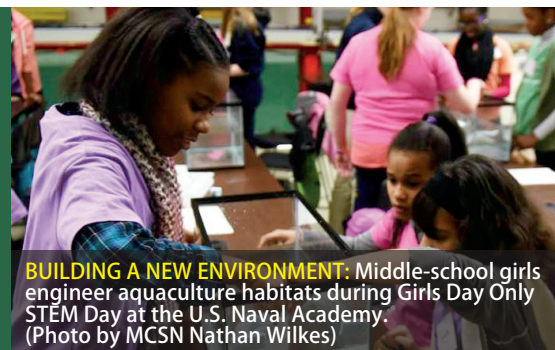
BUILDING A NEW ENVIRONMENT: Middle-school girls engineer aquaculture habitats during Girls Day Only STEM Day at the U.S. Naval Academy.

A group of middle-school girls gathered around a long wave tank, watching to find out if the coming wave would destroy the small cardboard houses they had built on wooden stilts and placed in the sand at the end of the tank. The girls were in the coastal lab at the U.S. Naval Academy (USNA), learning about the science of tsunamis and how engineers design structures.