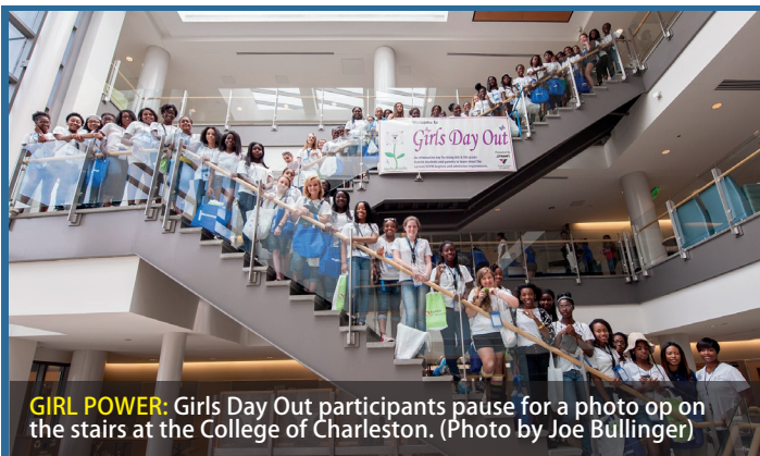
GIRL POWER: Girls Day Out participants pause for a photo op on the stairs at the College of Charleston.