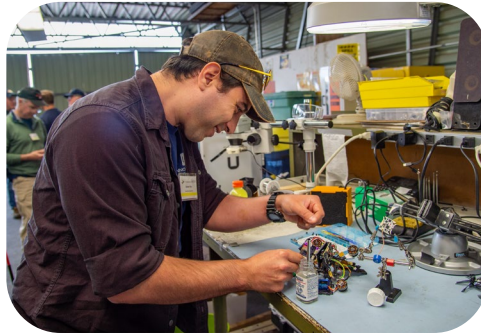
A-02: Phalanx Shield Multi-Domain, Innovative Algorithms