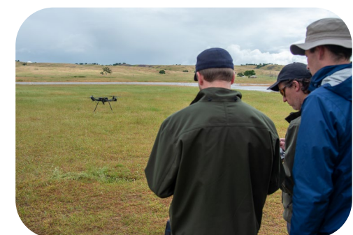
B-03: Block 1.5 Medium Lift Delivery Platform Flyoff, Drone Amplified