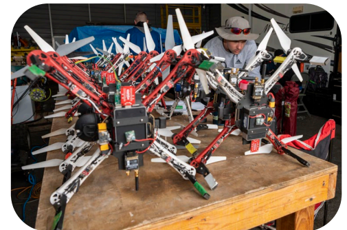
A-04: Multi-Agent UAS Teaming for Extended ISTAR and Autonomous Resupply, University of Nebraska Lincoln