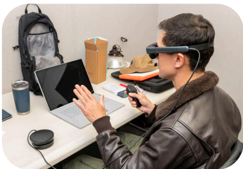
I-01: Wearable Brain Health Monitoring, NeuroFit