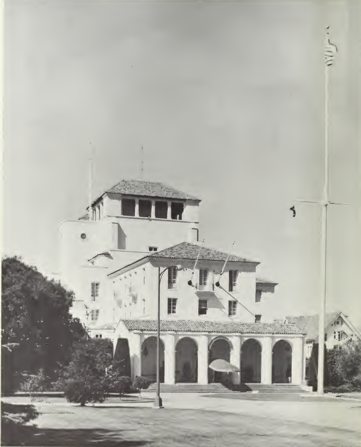
HERRMANN HALL, UNITED STATES NAVAL POSTGRADUATE SCHOOL